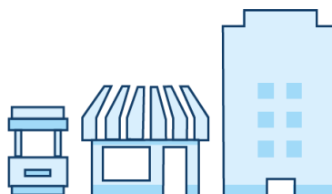
Small and Medium Enterprises